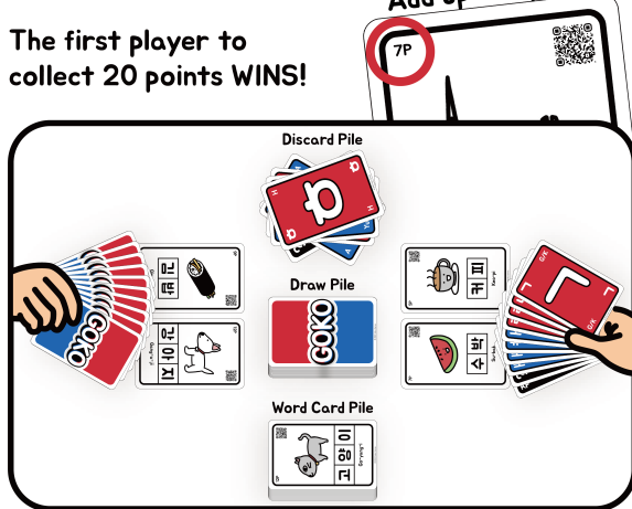
Game Setup Example for 2 Players